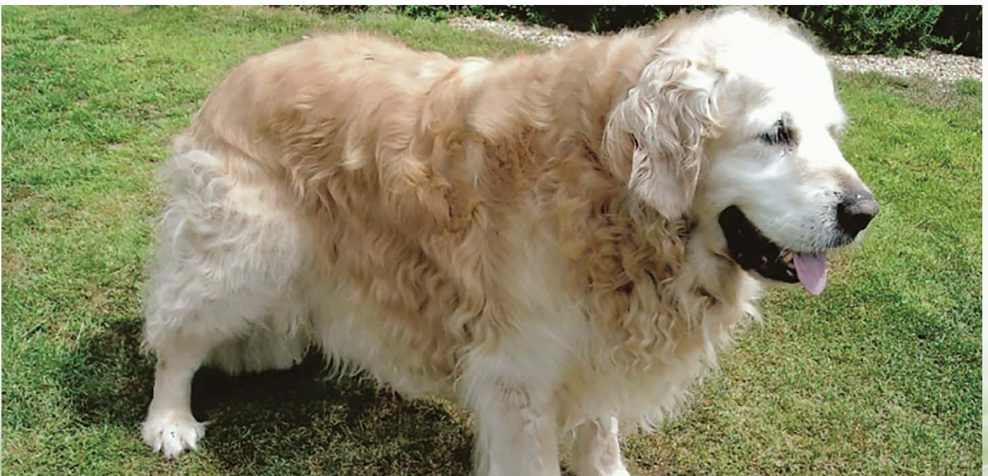
Ben at 11 years of age.

The baseline CBC, serum biochemical profile, assays of serum folate and cobalamin, and routine urinalysis were unremarkable. Faecal flotation was negative. Thoracic radiographs showed some indrawing of the dorsal tracheal ligament in the caudal cervical trachea, but was otherwise unremarkable. Abdominal ultrasonography was within normal limits, with no sonographic lesions of the small intestine or associated viscera. A fluoroscopic swallowing study confirmed normal cervical and oesophageal phases for both liquid and solid material. An ACTH stimulation test demonstrated adequate adrenal reserve, providing no support for the remote possibility of glucocorticoid-deficient hypoadrenocorticism. An ECG confirmed respiratory sinus arrhythmia, while echocardiography revealed significant mitral regurgitation, but no other valvular or myocardial lesions.