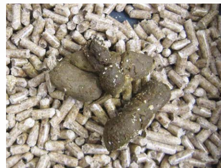
Figure 4: Faeces well-formed and normal in colour after 4 weeks of Feline EN St/Ox Gastrointestinal prescription diet (D60).