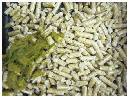
Figure 2: Faeces very soft and green at presentation (D0).