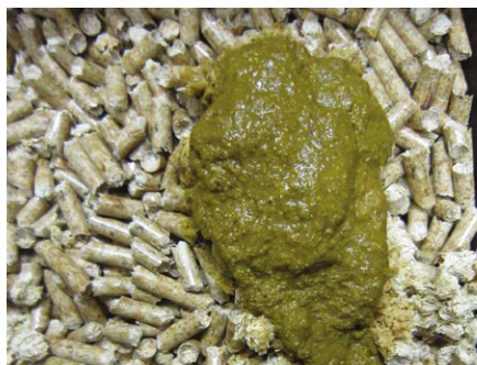
Figure 3: Faeces soft and green after 4 weeks of antibiotics and maintenance diet (D30).