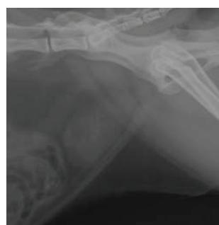
Radiograph of Candy at Do

The clinical signs associated with the ultrasound and radiograph suggest the presence of haemorrhagic cystitis perhaps accompanied by the presence of uroliths.