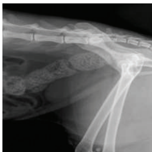
Radiograph of Candy after one month

management of idiopathic cystitis. In this case, the dry form was chosen to avoid changing Candy's dietary habits.