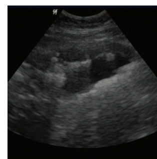
Ultrasound scan of Candy's bladder at Do