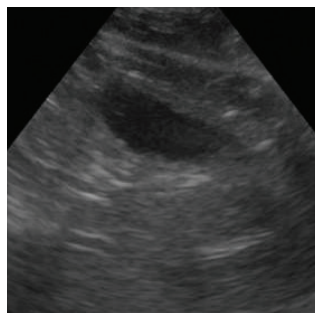
Ultrasound image of Candy's bladder after one month

The clinical signs disappeared rapidly after 3 days. At the check-up after 1 month, Candy's general clinical examination revealed no abnormalities. The radiographs and ultrasound scan no longer showed radiodense or hyperechogenic images. This progress was compatible with the initial presence of struvite uroliths, which are the only kind that can be dissolved medically in situ . Follow-up biological urinalysis and blood tests, together with medical imaging check-ups at 2 months and 4 months remained normal.