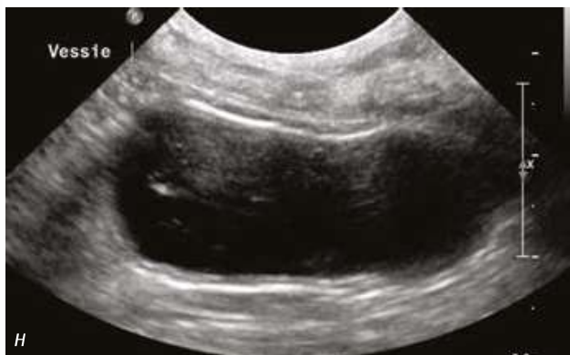
Radiological (G) and ultrasound (H) follow-up of the bladder calculi after 2 months. Note the absence of visible calculi and the presence of fine suspended particles (H).