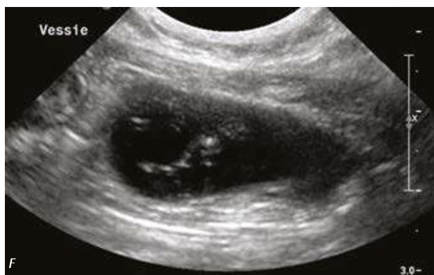
Radiological (E) and ultrasound (F) follow-up of the bladder calculi after 1 month. Note the absence of visible calculi and the presence of fine suspended particles (F).